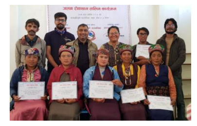
Community level health workers in Nepal trained in burn prevention.

In January, Interburns developed and delivered a new course for DG ECHO of March 2020. the European Commission to train rapid response Burn Assessment Teams (BAT) as part of the European response to burn mass casualty incidents. Collaborative work with the WHO on developing recommendations for burn mass casualty events has also recently been completed: <a href="https://doi.org/10.1016/j.burns.2020.07.001">https://doi.org/10.1016/j.burns.2020.07.001</a>