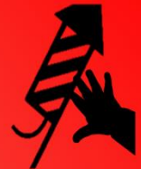
New Year Fireworks