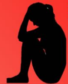
Talk to Someone

As the weather outside is frightful and the fire isn't so delightful. Since we've got no place to go STAY SAFE to be a Hero