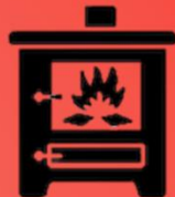
Log Burner Contact Burns