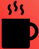
Hot food + drinks