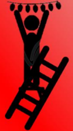
Falling from ladders