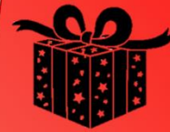
Xmas Toy Injuries